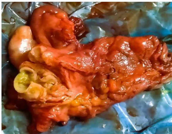
Figure 4. Intraoperative specimen from the inguinal hernia sac showing the rudimentary uterine horn and ovarian dermoid cyst.