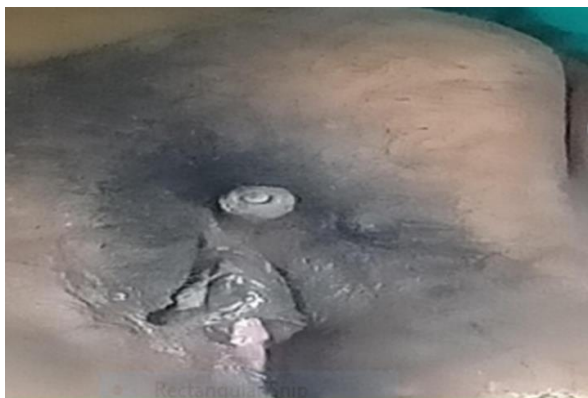
Figure 1. Preoperative photograph showing the left inguinal swelling and external genital features.

A 30-year-old nulligravida presented with an eight-year history of primary infertility and a progressively enlarging swelling in the left groin. Her menstrual cycles had remained regular since menarche at 12 years of age. There was no significant family history of endocrine, genetic, or urogenital disorders. All required consents were obtained prior to the preparation of this case report.