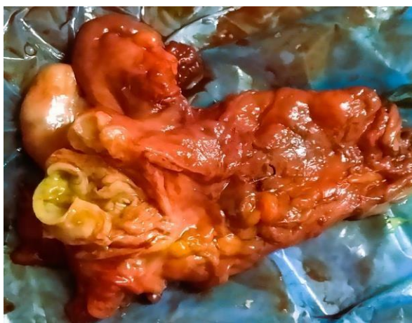
Figure 4. Intraoperative specimen from the inguinal hernia sac showing the rudimentary uterine horn and ovarian dermoid cyst.