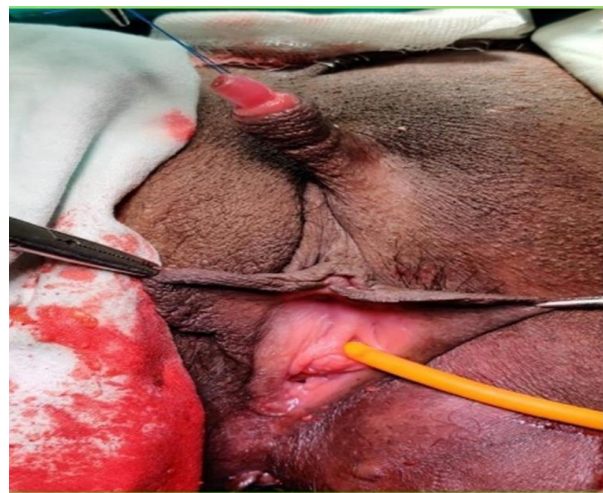
Figure 2. Intraoperative findings showing adnexal structures within the inguinal hernia sac.

Pelvic ultrasonography revealed a 12 × 6 cm pelvic cystic lesion extending into the left inguinal canal, suggestive of an adnexal mass herniating through the inguinal ring, along with a unicornuate uterus. Contrast-enhanced Computed Tomography (CT) urogram showed a malrotated, non-functioning left kidney with an absent ipsilateral ureteric orifice; the contralateral kidney was normal.