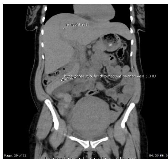
Figure A. Non-contrast computed tomography (CT) reveals a hyperdense serpiginous tubular

structure in the retroperitoneum, extending from the anterior aspect of the inferior vena cava (IVC) to the right ovary