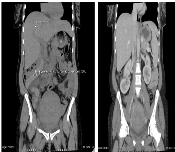
Figure B. Post contrast CT venous phase show filling defect in keeping with postpartum right-side ovarian vein thrombosis extending into the inferior vena cava (IVC)

Later that evening, the patient developed dyspnea, with oxygen saturation levels falling to 92-93%. The rapid response team was activated, and she presented with tachypnea while maintaining stable blood pressure and a temperature of 36.8°C. To maintain oxygen saturation, nasal oxygen was administered, and normal saline was infused. An urgent CT pulmonary angiogram was conducted to rule out pulmonary embolism, and surgical evaluation was initiated due to rebound tenderness in the right iliac fossa, leading to her transfer to the medical intensive care unit due to a high likelihood of pulmonary embolism.