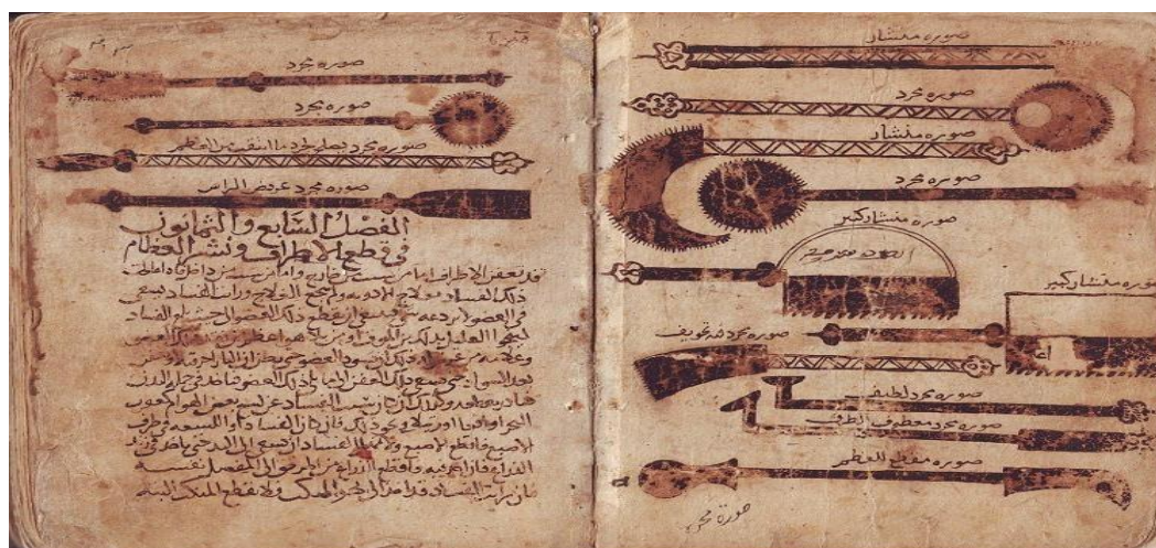
Fig 3. A page of Al-Tasrif depicting the surgical tools devised or utilized by Abulcasis. Kept in Institute of Manuscripts of Azerbaijan National Academy of Sciences in Baku

Dysmenorrhea in Al-Tasrif and comparing it with current medicine: Abulcasis defined dysmenorrhea by these words: "Some women experience pain two or three days before menstruation in the pre-umbilical or low back area. Premenstrual pain is accompanied by fatigue and a sense of heaviness. Sometimes the pain is so severe that they feel erupting like a volcano. This condition continues until bleeding happens". In current medicine, primary dysmenorrhea is defined as fluctuating and spasmodic menstrual cramps without any macroscopic pathology. It always begins few hours before or with menstrual bleeding and lasts maximum