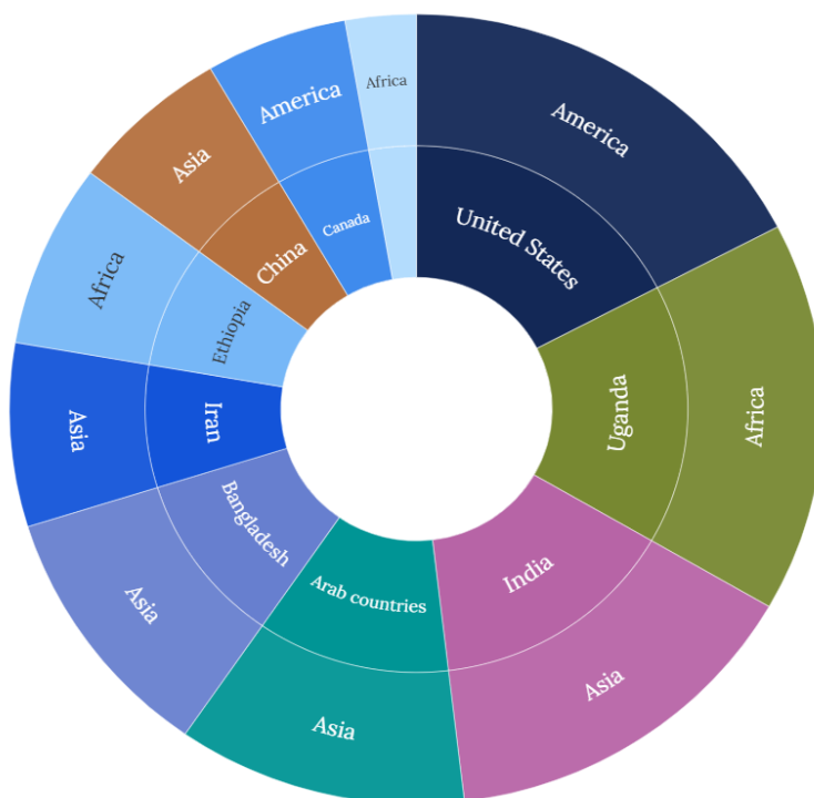
Figure 1. Geographical distribution of included studies by continent and country

The pooled prevalence of domestic violence against women during COVID-19 lockdowns was estimated at 36%, indicating that more than one in three women experienced violence during this period. Psychological violence was the most prevalent form (32%), followed by verbal violence (29%), while physical and sexual violence were each reported by 16% of women.