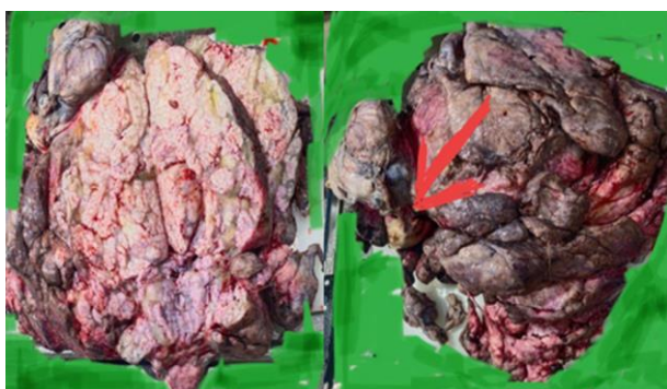
Figure 1. Illustrates the gross specimen of the uterus with cervix, showcasing the attachment of a prominent adnexal cotyledonoid mass, reminiscent of a placental-like appearance.

Gross examination revealed a uterus with cervix and attached bilateral adnexa measuring 9x6.5x3 cm, accompanied by a large mass attached to the uterus measuring 43x35x10 cm. The endocervical canal measured 2.8 cm, while the endometrium measured 0.2 cm. The myometrial thickness varied from 2 to 17 cm, displaying irregular grey-white to grey-brown cotyledons upon serial sectioning (Figure 1).